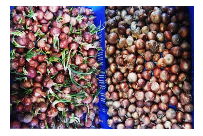
Figure 5. The mostly sprouted and unmarketable bulbs in un-treated control (A- 240 days after irradiation), and un-sprouted and marketable bulbs (B- 240 days after irradiation at 100 KGy)