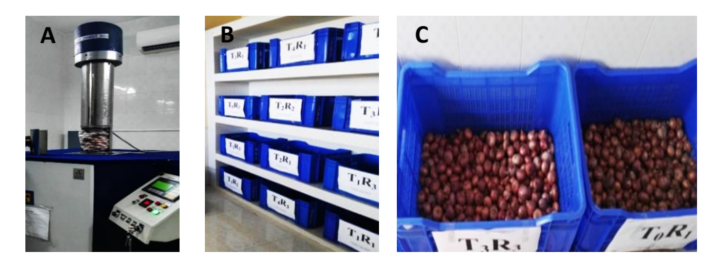
Figure 1. Application of gamma irradiation to the experimental onion bulbs using <sup>60</sup>Co gamma irradiator (CG-5000- A), and the irradiated onion bulbs held in rigid plastic crates and stored at ambient condition for observation (B and C)