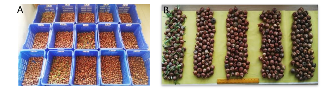
Figure 4. The experimental view (A- 180 days after irradiation) and variation among treatments in terms of sprout inhibition (B- 200 days after irradiation)

In a column, the figures having common letter do not differ significantly at 5% level of significant.